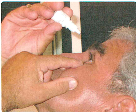
Artificial tears or steroid eye drops may help relieve redness, swelling or dry eye from blepharitis.

Antibiotics. Your ophthalmologist may have you use an antibiotic ointment on your eyes. Put a small amount of ointment on a clean fingertip or a cotton swab (Q-tip). Gently apply the ointment to the base of your eyelashes. Do this just before bedtime, or as your doctor recommends. Your doctor might prescribe an antibiotic medicine for you to take by mouth.