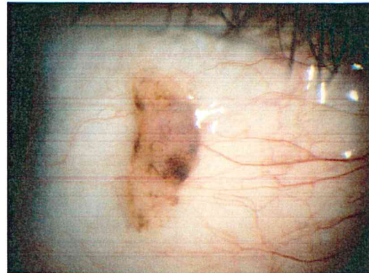
A nevus on the surface (conjunctiva) of the eye

Retina: Layer of nerve cells lining the back wall inside the eye. This layer senses light and sends signals to the brain so you can see.