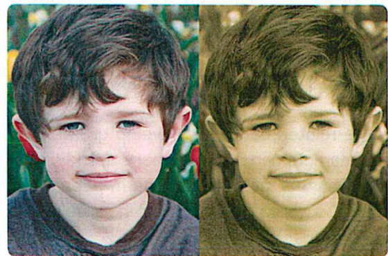
Left, normal vision. At right, dull or yellow vision.