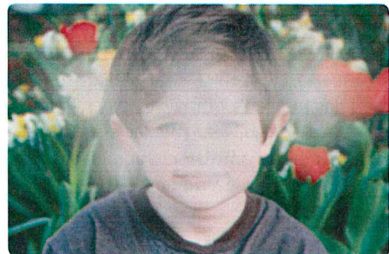
Blurry or dim vision